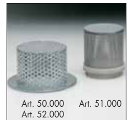
Art. 50.000 Art. 51.000 Art. 52.000